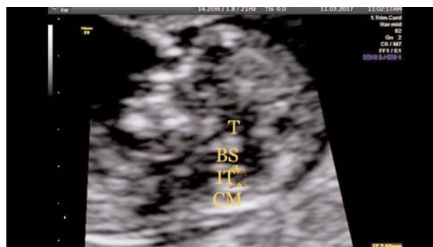
Fig. 1. Ultrasound image in the mid-sagittal plane of the fetal face showing thalamus (T), brain stem (BS) and cisterna magna (CM). The fourth ventricle presents as intracranial translucency (IT) between the BS and the choroid plexus.

CRL groups. Nomograms and formula of IT diameter were obtained according to CRL.