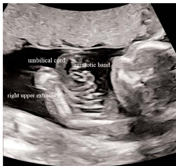
Fig. 2. The presence of an amniotic band in close relation to the edematous right upper extremity.