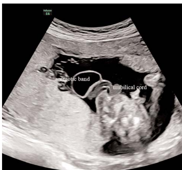
Fig. 1. An amniotic band was observed in close relation to the umbilical cord.

wrapped around the right upper extremity over the elbow. While the forearm and the hand at the distal of the constriction ring were edematous, hyperemia was observed at the proximal ( Fig. 3 ). The wrapped portion of the amniotic band was cut using endoscopic scissors (26159 SHW, Karl Storz, Tuttlingen, Germany) and grasper (26159 UHW, Karl Storz, Tuttlingen, Germany). On fetoscopic view, the extremity was floating freely following the procedure, and the umbilical cord was released ( Supplementary material: S-Video 1 ). The patient received tocolytic treatment and antibiotic prophylaxis before the procedure. On the postoperative second day, ultrasonographic examination showed the presence of distal blood flow at the right upper extremity and the reduction in the pre-operative edema. Furthermore, it was observed that the umbilical cord was freely floating in the amniotic cavity. The postoperative course was uneventful and the patient was discharged on the second day after the operation. Then, the patient was followed at two-week intervals. At 36 weeks of gestation, a 2300 g baby with Apgar score 5/10 was delivered via Cesarean section, with the indication of premature rupture of membrane and failed induction of labor. On neonatal examination, a skin lesion resulting from the constriction ring was found slightly over the elbow level