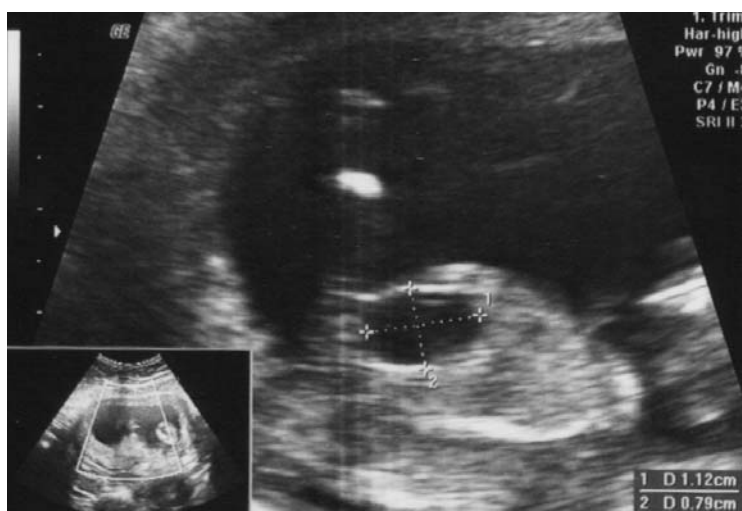
Figure 2. Fetal megacystis: two dimensions of fetal bladder.

It was found in the study performed by Gilpin et al. [8] that bladder muscle fibers and autonomic innervation completely developed only when CRL was 77 mm (13.5th week). In the light of this study, this temporary distention of bladder can be explained by the development of a temporary function disorder arising during bladder development. Although it can be the indicator of fetal aneuploidies, the prognosis of fetal megacystis found on first trimester is usually good in most of pregnant women who have normal karyotype. In a retrospective study examining 145 fetuses with fetal megacystis on 10th-14th gestational weeks, 25% of fetuses with 7-15 mm longitudinal diameter of bladder (most frequent trisomy 13 and 18) and 10% of fetuses with more than 15 mm longitudinal diameter of bladder had chromosomal anomaly. [9] In 90% of fetuses with 7-15 mm bladder diameter and without chromosomal anomaly, spontaneous regression was found in bladder sizes and no negative outcome related with urinary system was found during pregnancy. [9]