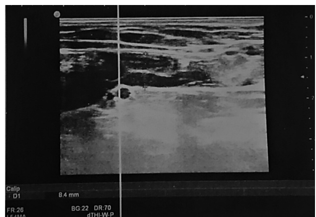
Fig. 3. Varicose veins reaching towards inguinal canal and dilatation in the inguinal canal at this level are seen.